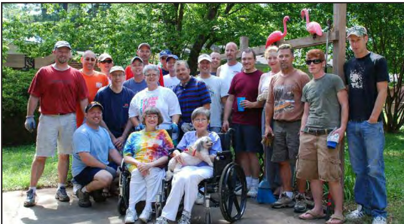
Lindenwood's Unity Group is tired and proud.

These are the people of Lindenwood. These are true Disciples of Christ. Lindenwood Where we belong.