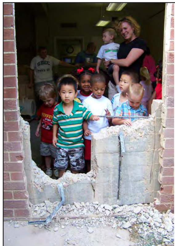
The older children look out the new doorway of the Little Lamb room.