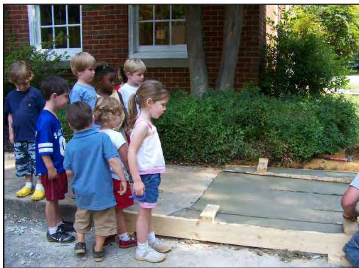
The construction of the new ramp was very interesting to these little ones.