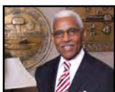
Mayor A C Wharton, Jr.